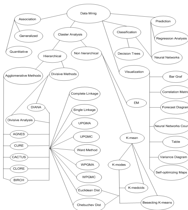
Fig 2 - Partial Data mining ontology model

This ontological model includes two abstract classes: Account and Person. Class Account represents the user as the logical nature of the user system. Class Person represents the user as the